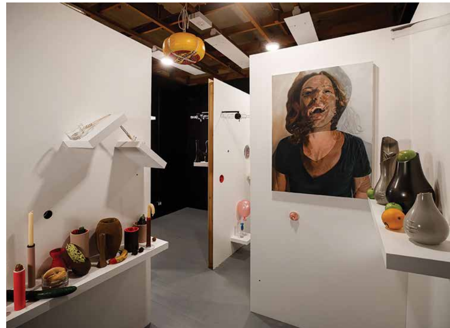
Image: Aleda Laszczuk, Fractured States (fuck me, but fuck you too) , 2019 [detail].