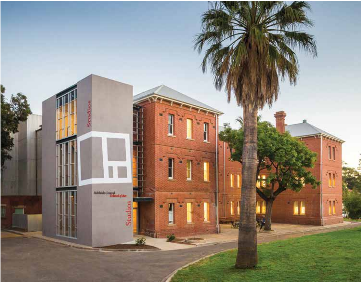
Image: Teaching and Studio building.

We perform exceptionally well in the national QILT Student Experience Survey. For the third year running we have been identified as the best art school in Australia.