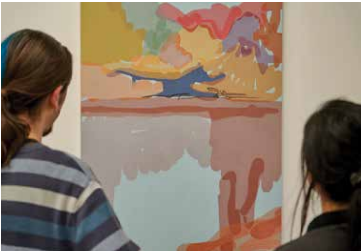
Image: Open Day August 2019.

Artlink is a peer-reviewed publication with strong national and international networks that covers contemporary art from Australia and the Asia-Pacific. It is independently edited and published by Artlink Australia (located within our Administration Building).