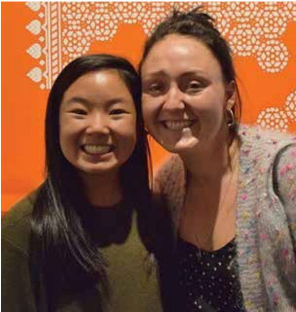
Image: Students at Only Connect exhibition opening, 2019.