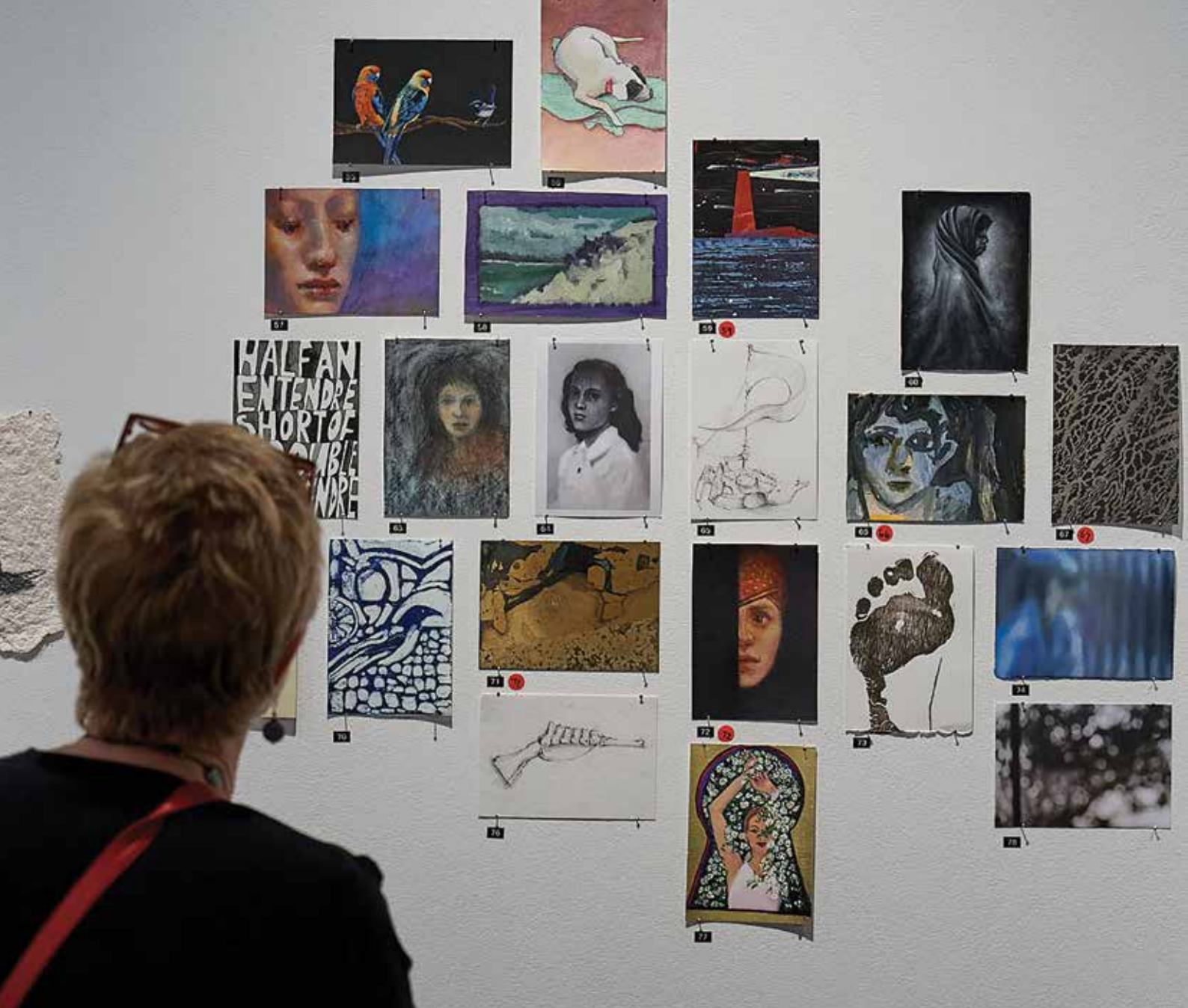
Image: Wish you Were Here exhibition opening, 2019.