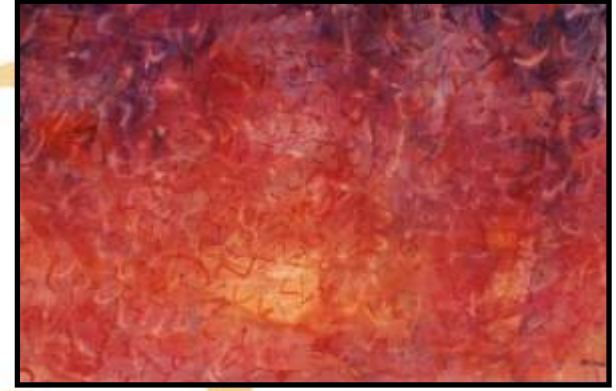
“Abstract Watercolour” ARTHUR PHILLIPS