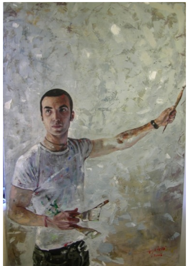
Hijo de la rebeldia , Ignacio Rojas-Corral, 2006, oil on canvas, 100 x 150