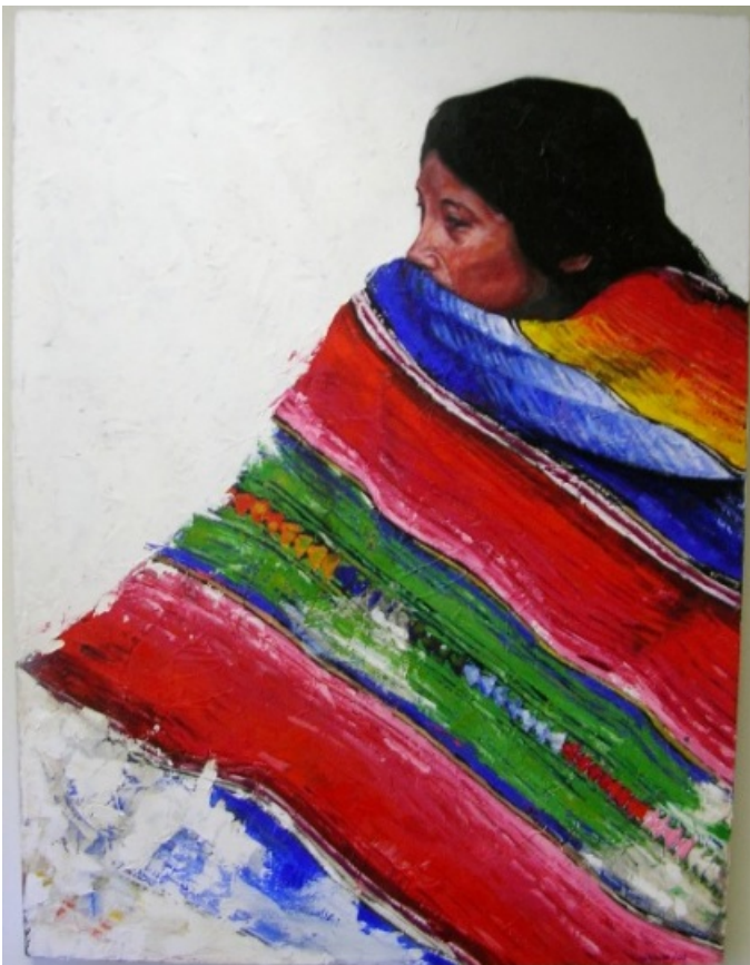
Indigena , Ignacio Rojas-Corral, oil on canvas, 2006 92 x 120 cm