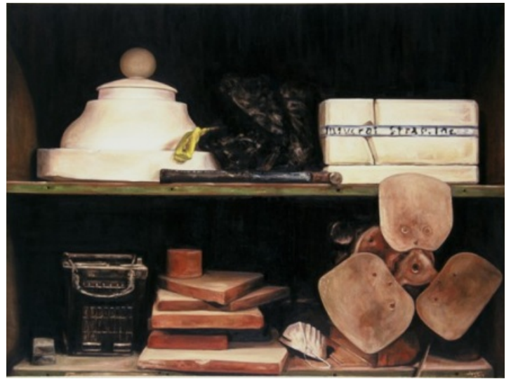
Day Job , Ignacio Rojas-Corral, oil on canvas, 2004 76 x 101cm