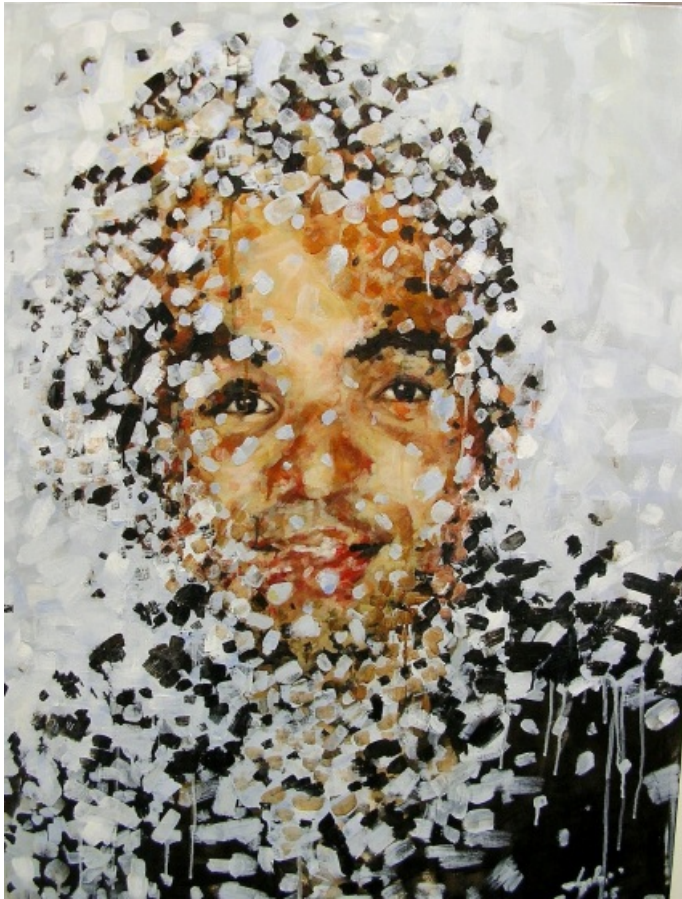
Self-identity , Ignacio Rojas-Corral, oil on canvas, 110 x 84cm