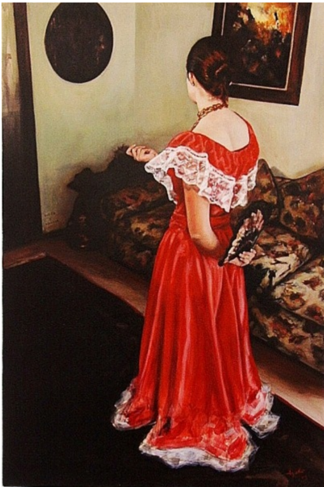
Lady in Red , Ignacio Rojas-Corral, oil on canvas, 70 x 104cm