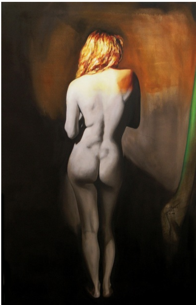
Forgotten Colours , Ignacio Rojas-Corral, oil on canvas, 130 x 84cm