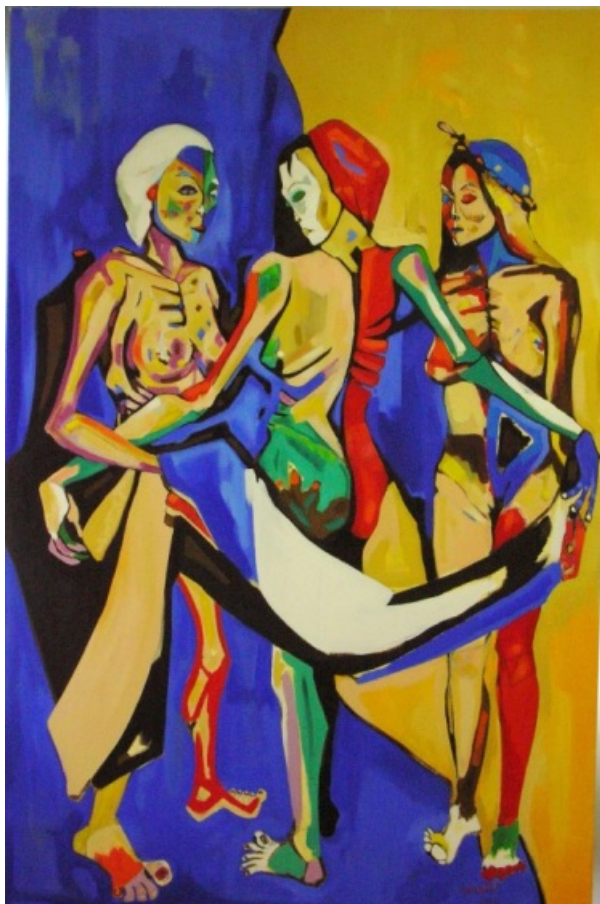
Three Sisters , Ignacio Rojas-Corral, oil on canvas, 2006 100 x 150 cm