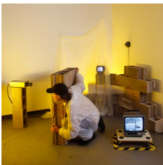
image | detail: postcard artwork by Tom Moore exhibited and sold in 2016